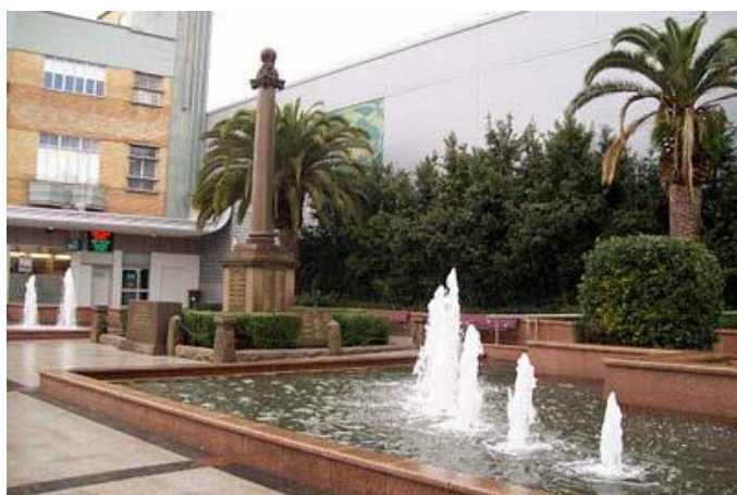
Hurstville War Memorial