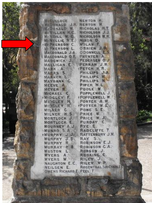
Sutherland War Memorial