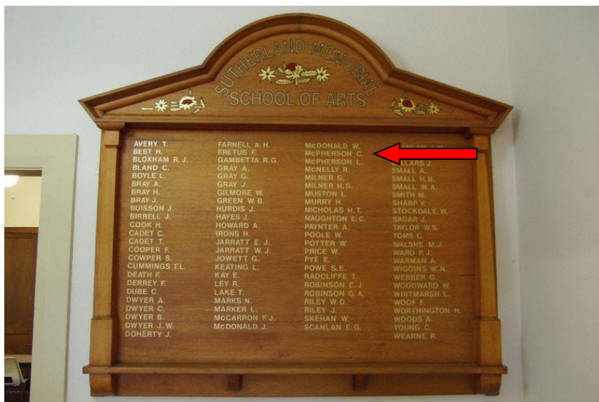
Sutherland School of Arts Honour Roll